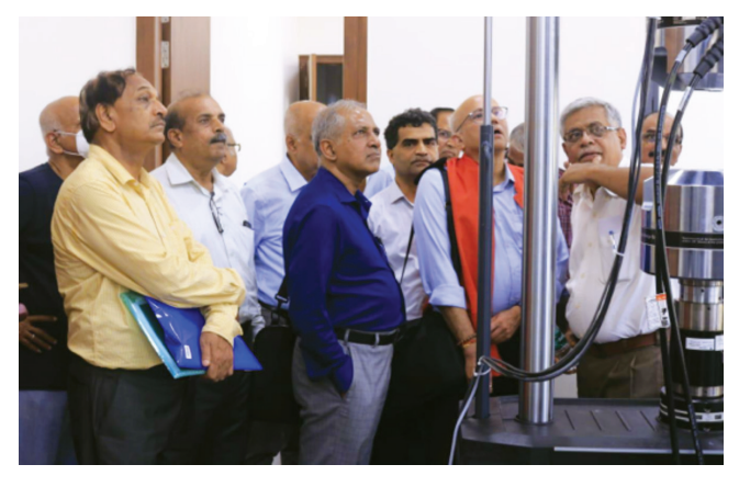
Visit to Central Research Facility (CRF)