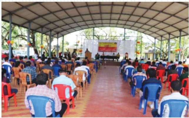
Celebrating the Kannada Rajyotsava Day