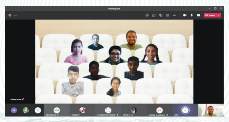
Online training of high school students

The Youth Leadership Programme (YLP), with a motto of "Giving back to the Society", was taken up by NITK Toastmasters. In March 2021, members of the Club delivered 2-hour sessions every Wednesday and Saturday in NITK English Medium School. The sessions were structured for a small group of 20 students from Class 8. The students learnt the basics of public speaking through practical experience.