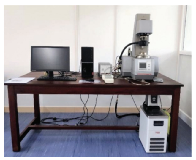
Advanced Modular Rheometer

& Zeta Potential Analyzer, Controlled Current-Voltage Source for Thin film Multilayer coatings, Ion Chromatography, Advanced Modular Rheometer, X-ray diffractometer with accessories and High-resolution Liquid Chromatography Mass Spectrometry.