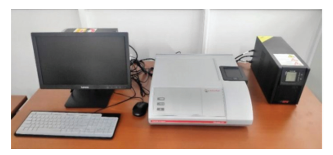
Particle Sizing and Zeta Potential Analyzer